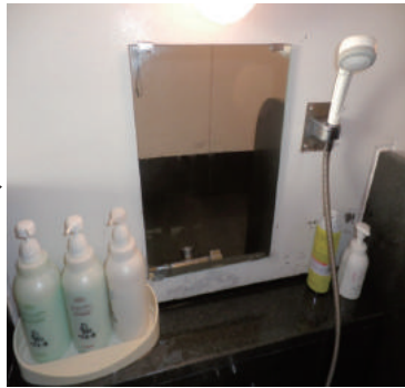
New coated mirror