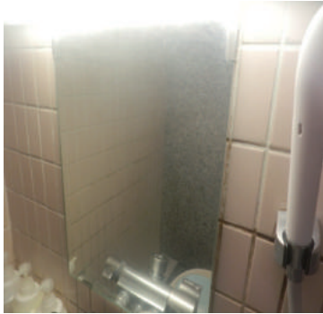
Mirror with white stains and no coating

Easy daily maintenance is enough for the mirror to stay clean and dirt-free.